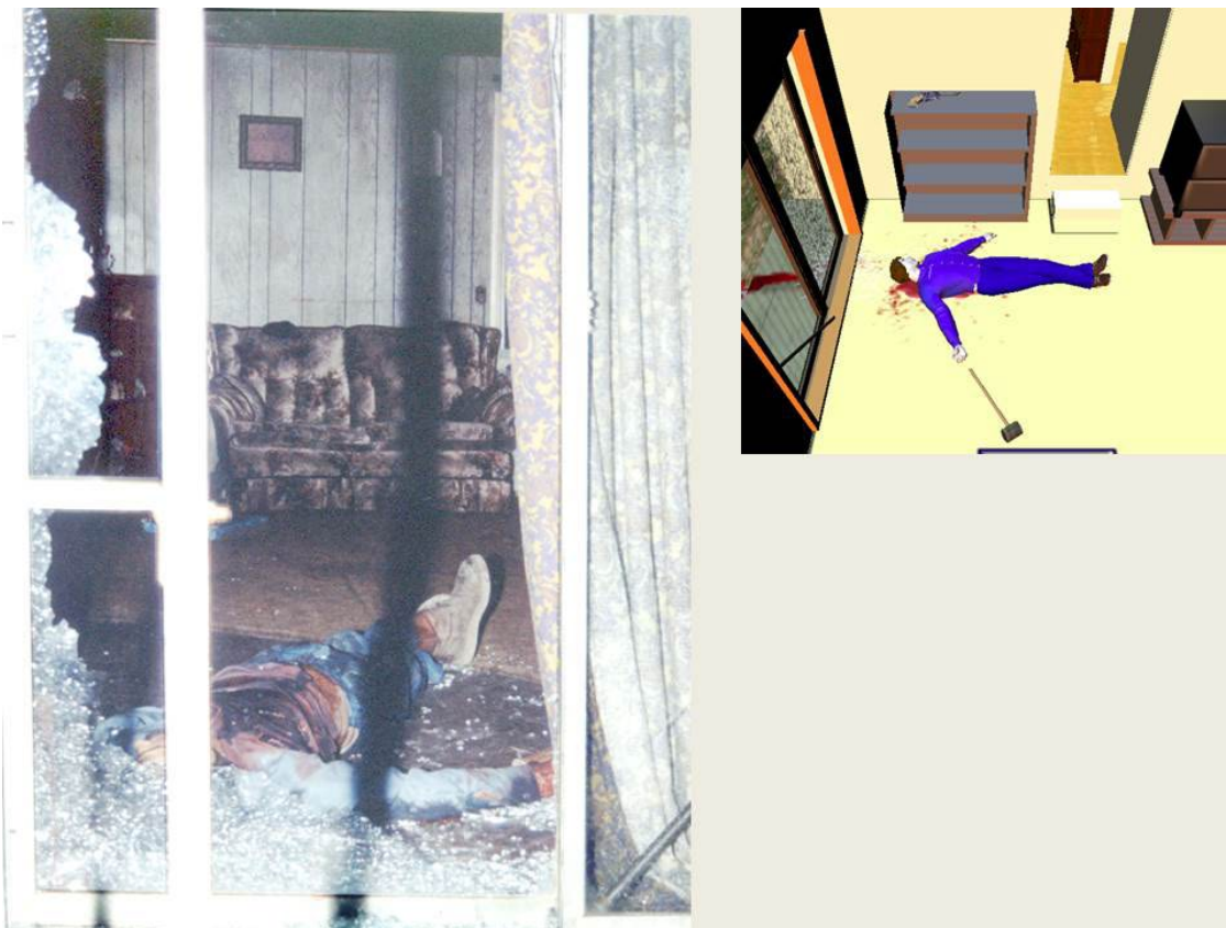
FIGURE 1: In the example scenario, the victim’s body was found on the floor of the den and is shown from outside through the broken glass patio door. The scene sketch shows the victim’s position relative to other objects in the den including the hammer near his right hand.