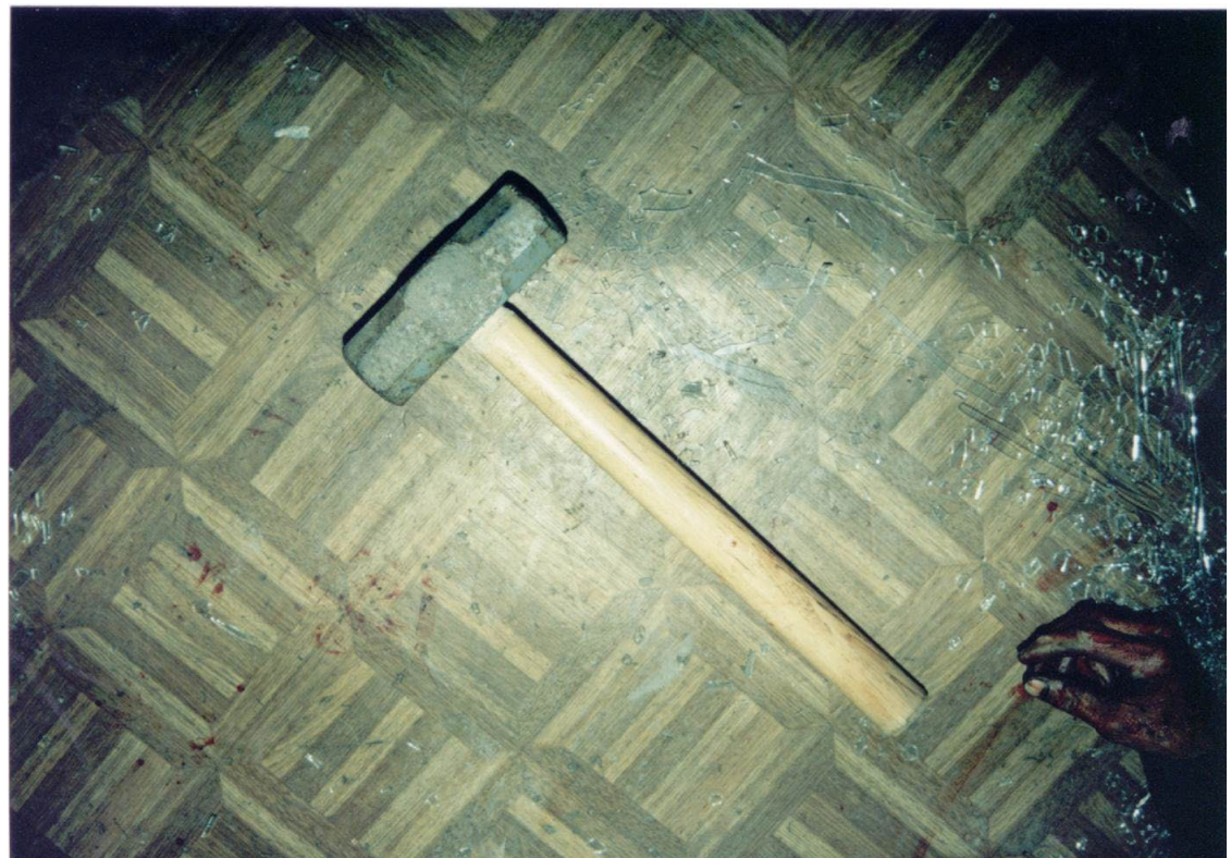
FIGURE 7: The clean hammer was found next to the victim's bloody right hand on the den floor.