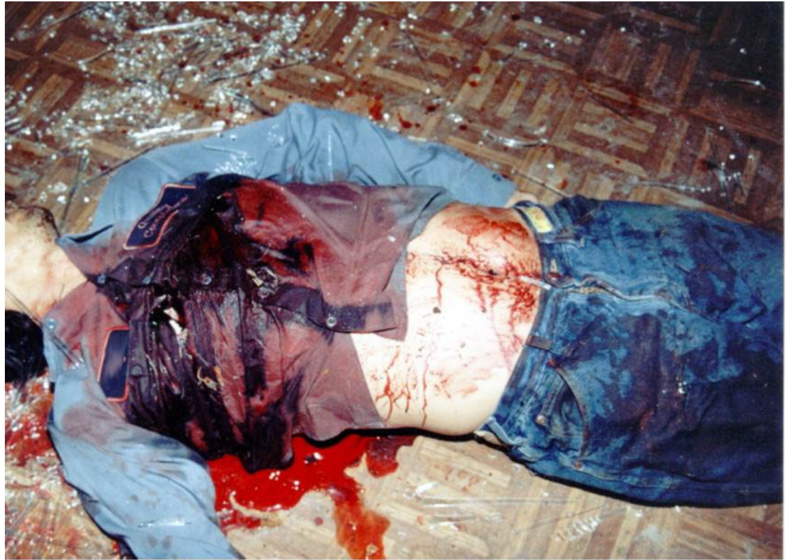
FIGURE 6: In the example scenario, the victim was found supine on the den floor with a gunshot wound to the chest. Broken glass was on top of the victim and the victim's blood. This contradicts the suspect's statement noted in Figure 2 that he shot the victim after the victim broke the glass and had entered his home.